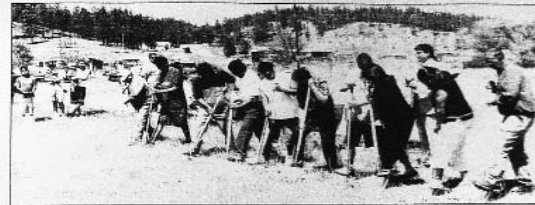
Big Horn County News Photo by Dick Crockford Shovels glint in the sunshine as work begins on the new recreation complex at Lane Deer.

Plans call for eventually including basketball courts, volleyball courts and soccer fields, a walking path, horseshoe pits, barbecue areas, restrooms and a concession stand, and there is even talk of a community swimming pool at the site.