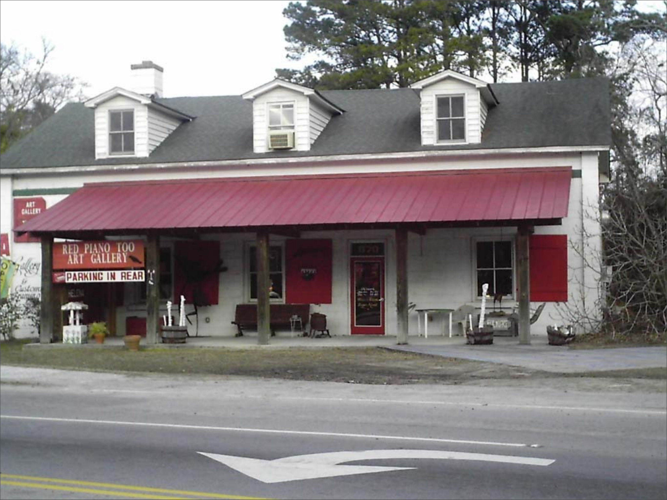
Thursday, March 3, 2011