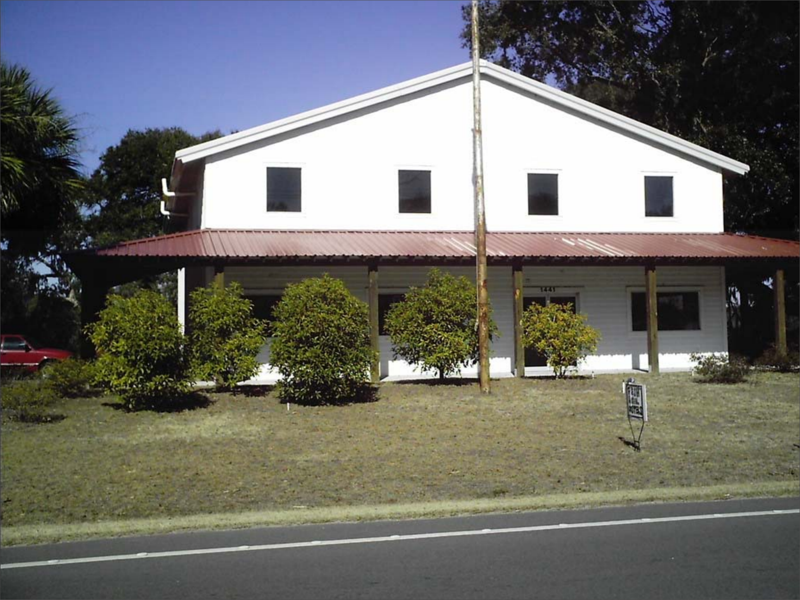
Thursday, March 3, 2011