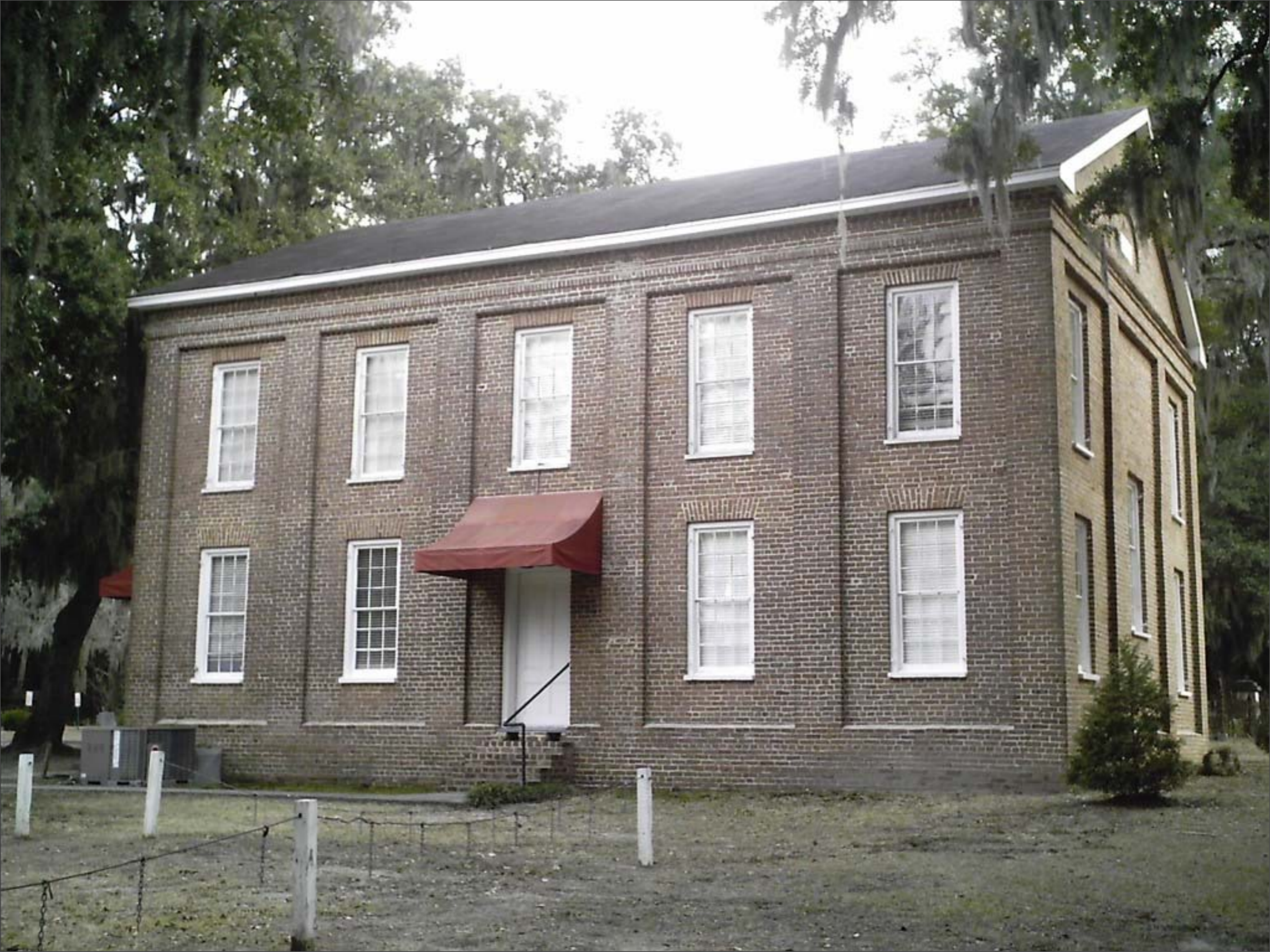
Thursday, March 3, 2011