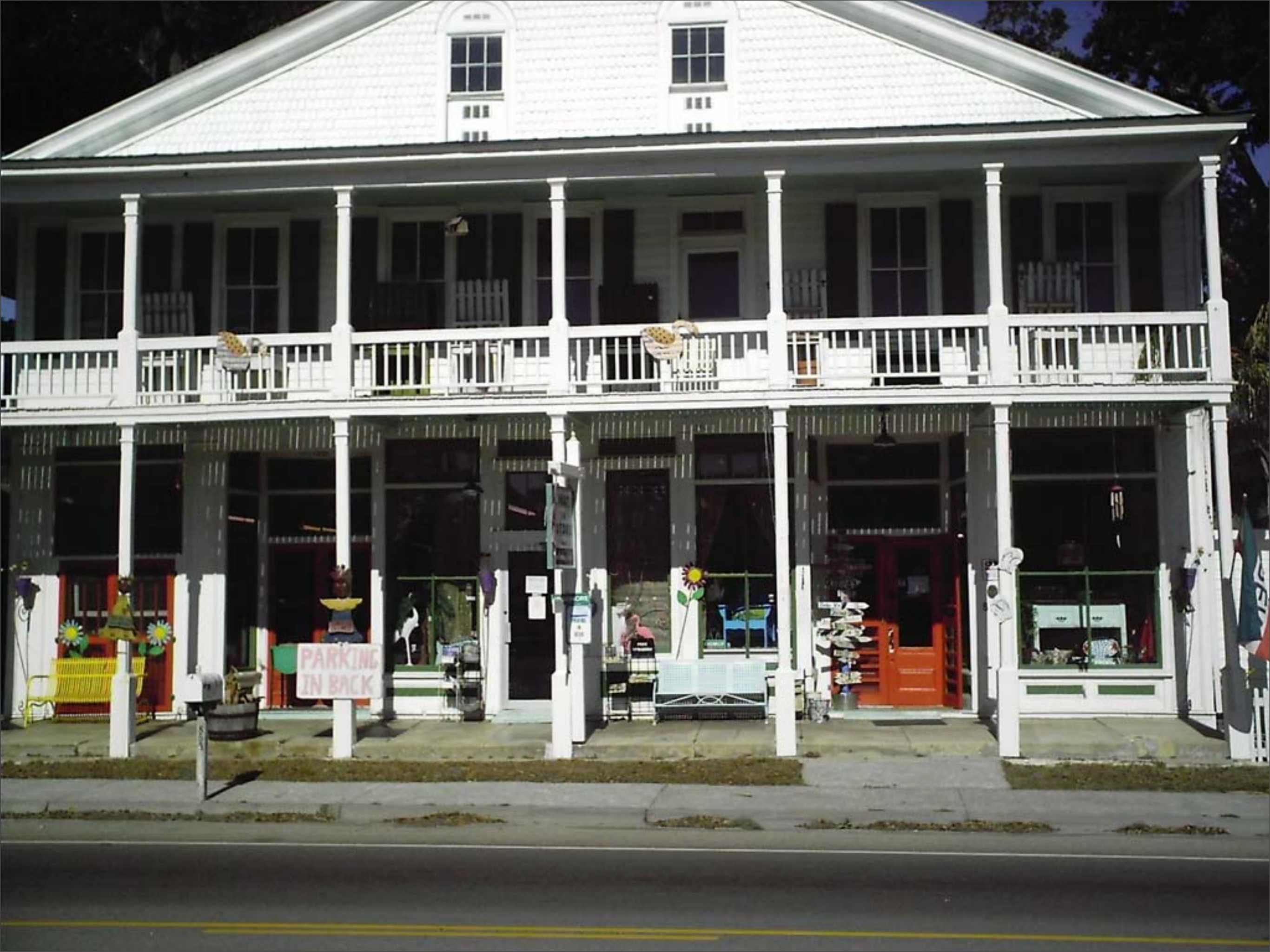
Thursday, March 3, 2011