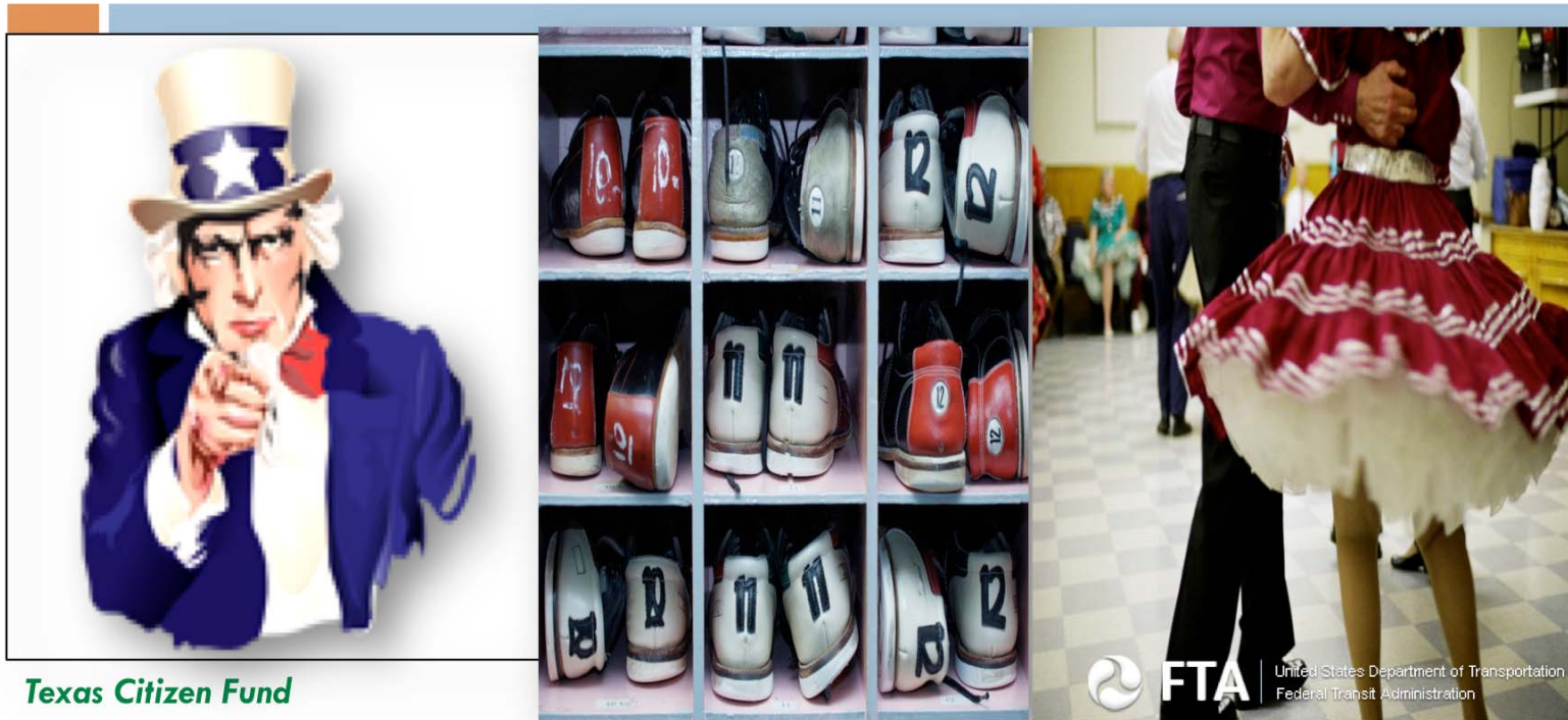
Texas Citizen Fund