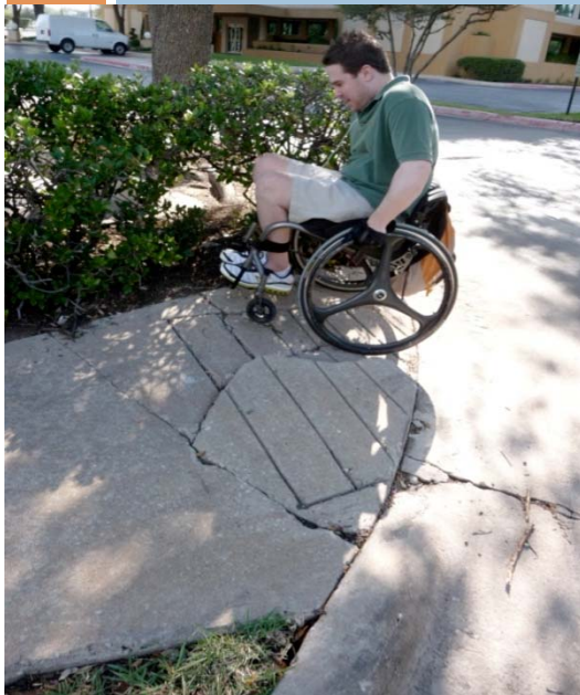
Texas Citizen Fund