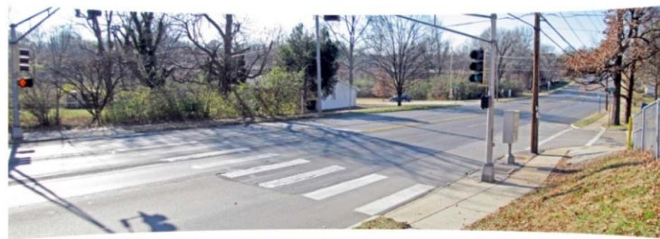
Image Caption: The above image shows the existing crosswalk adjacent to Griffith Elementary School near the intersection of Chambers Road and Day Drive.