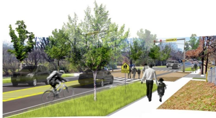
Image Caption: The above image is a rendering of what a complete streets treatment of the site could look like. In this scenario, students would have a shorter distance to cross the street, there would be more signage to alert drivers of the crosswalks, the intersection at Chambers and Day would become a true intersection, Chambers would be put on a "road diet", and bike lanes would be added.